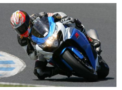
Above: Cameron Donald was back in action during a track day at Phillip Island.