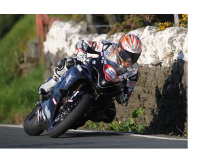
Above: Cameron Donald was in scintillating form last year before an off at Keppel Gate in practice ruled him out of the races.