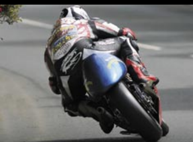
Above and Below: The Billown course plays host to some of the closest racing you're ever likely to see with classics, two-strokes, supertwins and more all doing battle.