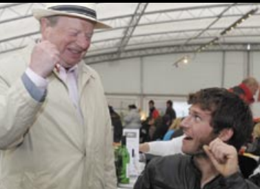
Above: A meeting of two great minds! Who knows who you'll bump into in the VIP TT hospitality suite.

You can reserve your place in the TT VIP Club now by calling +44 1624 694456 or email sales@regencytravelholidays.com