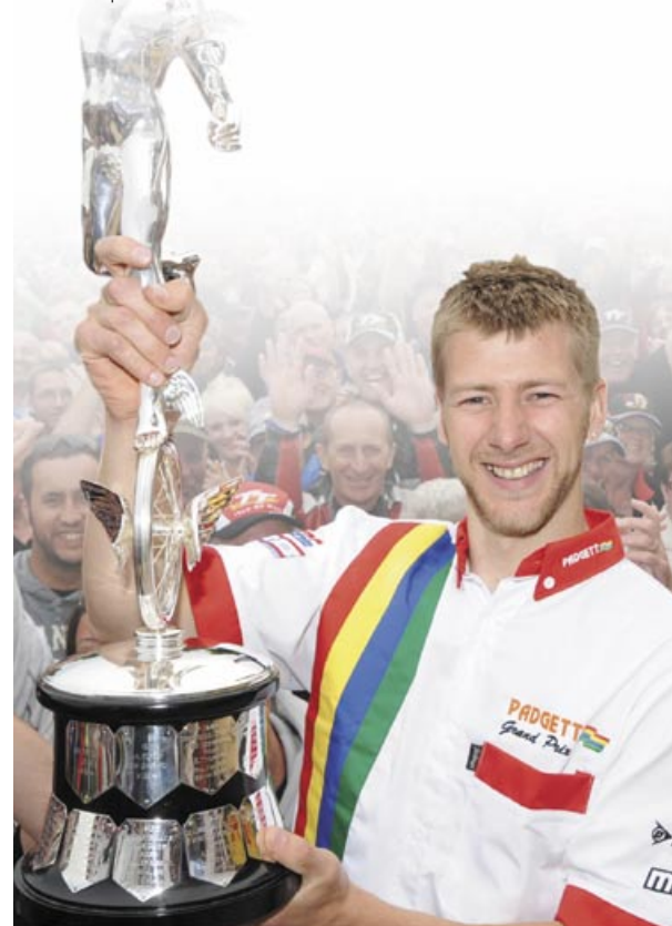
'Hutchy' enjoyed TT 2009 after a miserable 2008. What's in store for 2010?

The TT is really undergoing a huge resurgence. The organisation is really professional and really focused on what the teams and riders want. You get a sense that people are listening to us and people really go out of their way to help you. The whole event is run professionally and you only need to see the difference in the paddock. There's a real buzz about the place.