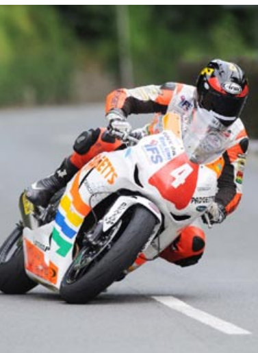
Above: Hutchy on THAT record breaking lap, overhauling Guy Martin to take victory in the TT Supersport Race - Hutchy's second win of the day!