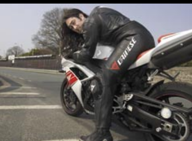
Below: Biking Comedian Ross Noble