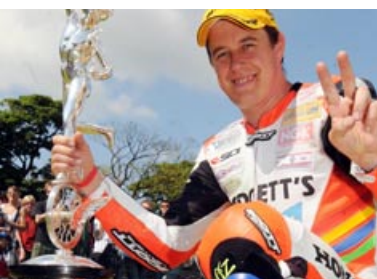
Above: John McGuinness was in Padgett's colours when he equalled Mike Hailwood's 14TT wins with victory in the Senior TT.