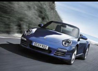
Above: Prestigious car brand Porsche will carry out official duties throughout TT2010.